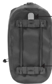
Version with racktime adapter Snap-it (bottom view) for racktime racks