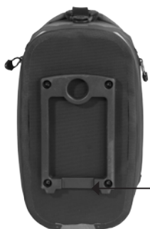
Version with ORTLIEB adapter (bottom view) for touring racks