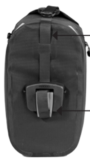
Version with Rixen&Kaul adapter (bottom view) for seatpost racks