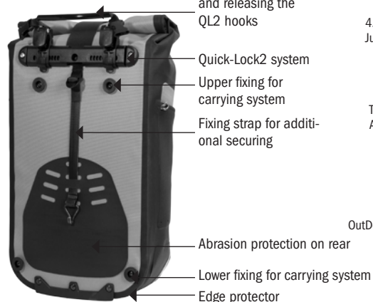
Application: pack for mounting to rack, carrying system demounted