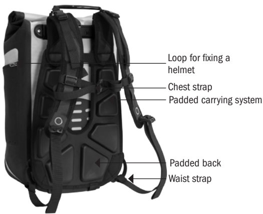
Application: carrying system mounted